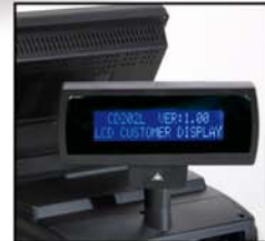
LCD Customer Display: Fully integrated; intense blue light display. Part # 30004 - Black Part # 30003 - Ivory