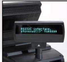
VFD Customer Display : Ideal for publicity and marketing purposes. Part # 30006-Black Part # 30005-Ivory