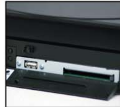
PCMCIA: Integrated PCMCIA and USB port in front. Part # 20300