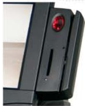
FSM : Finger Print Sensor. Smart Card Reader. Magnetic Stripe Reader. Part # 20501- Black Part # 20502- Ivory