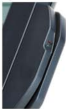
Magnetic Stripe reader: 3-track, integrated card reader easy configuration. Part # 20004- Black Part # 20003- Ivory